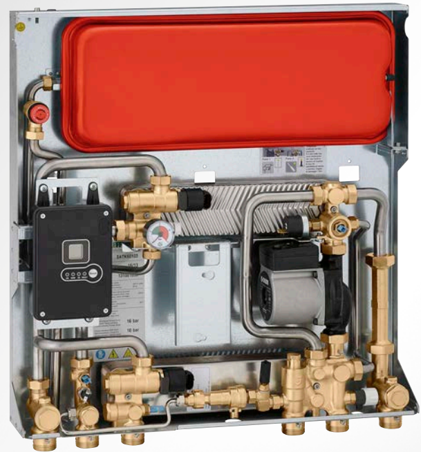
RECESSED VERSION - SATK60 SERIES