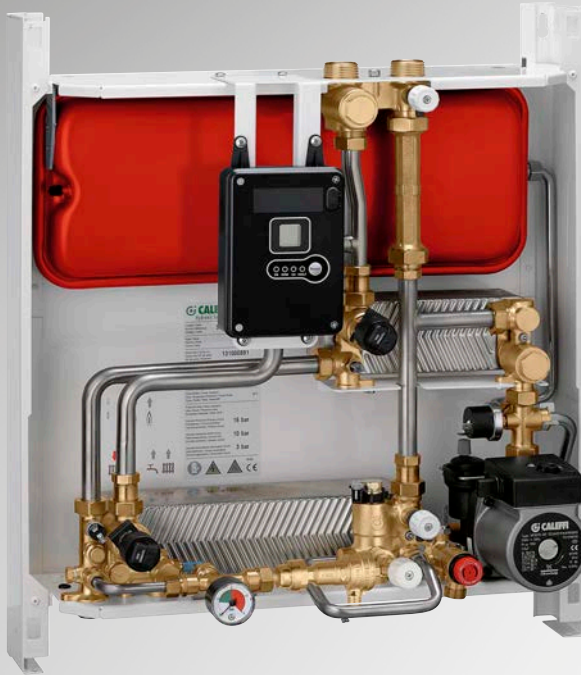
WALL-MOUNTED VERSION - SATK30 SERIES