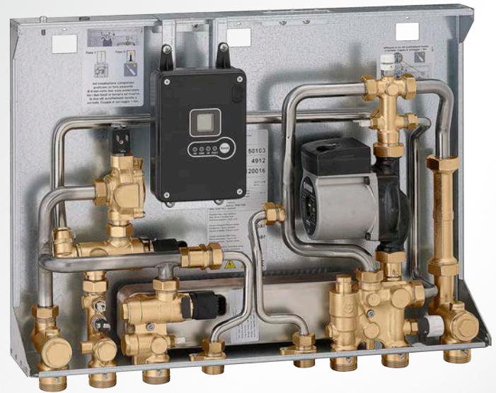
RECESSED VERSION - SATK50 SERIES