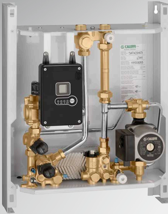
WALL-MOUNTED VERSION - SATK20 SERIES

Energy management requires accurate measurement