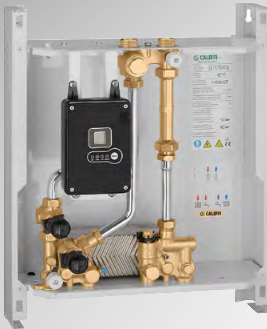
HIGH TEMPERATURE VERSION

Energy management requires accurate measurement