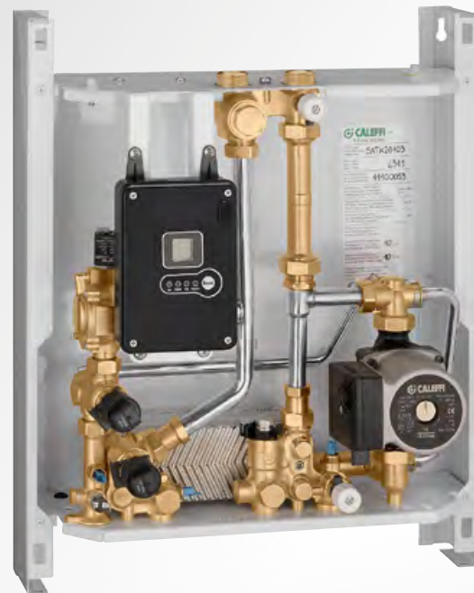
LOW TEMPERATURE VERSION